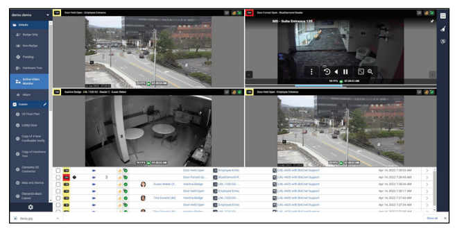
OnGuard Monitor client and the new Active Monitor display