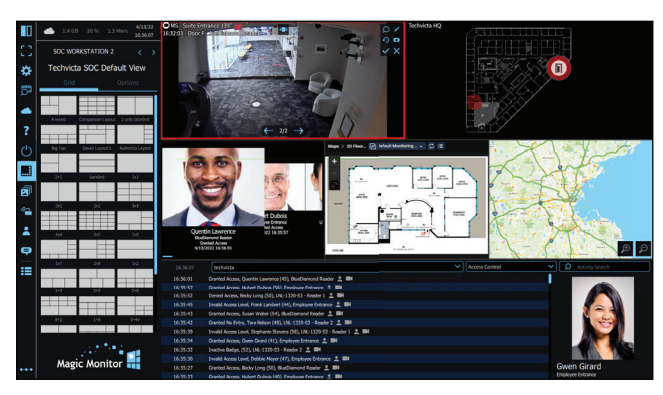
OnGuard system alarms, cardholders, video and system data, as viewed in unified Magic Monitor client