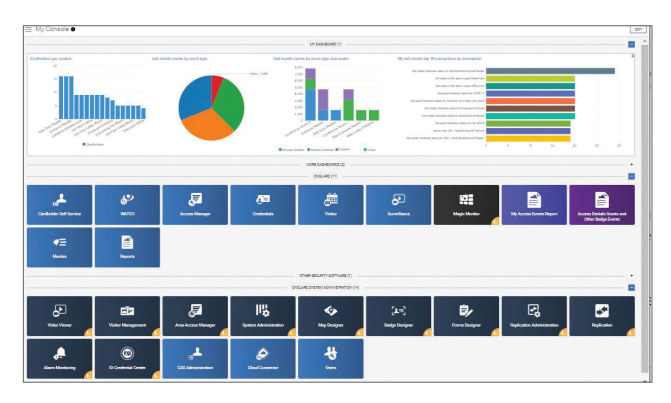
LenelS2 Console launchpad showing custom dashboards