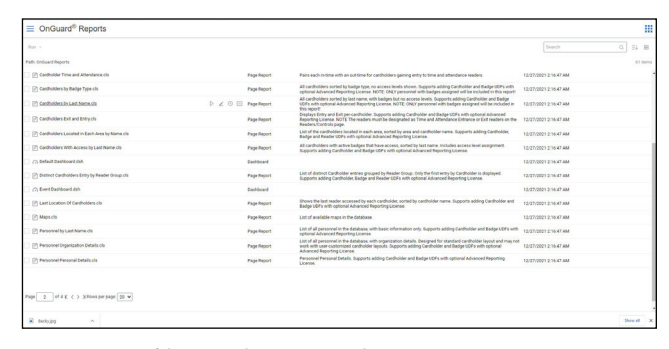
Reports & Dashboards client reports list and descriptions