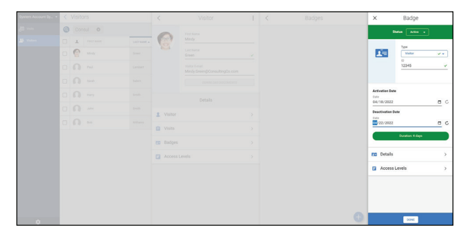
OnGuard Visitor client adds management of Badges and Access Levels