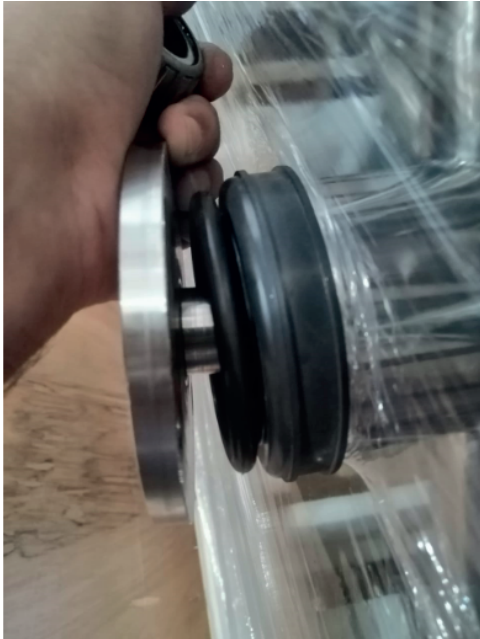
3. Base montada con empaque