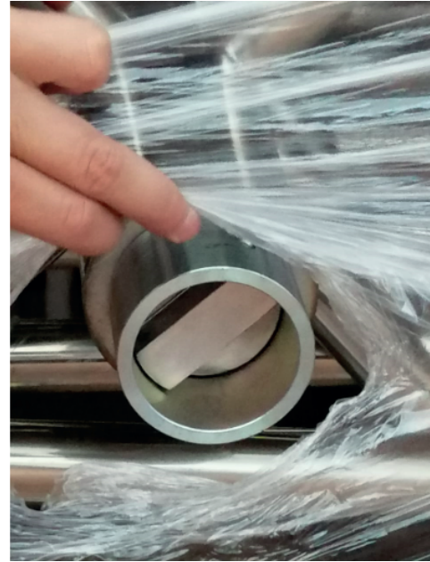
4. Horquilla para base superior