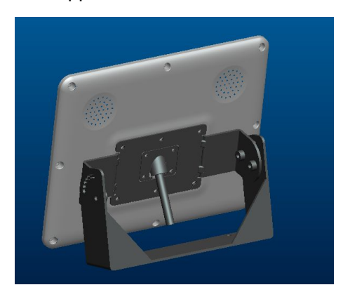
Suitable for relatively flat console

CP4 supports bracket installation, and there are three brackets to be chosen: