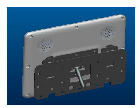
Suitable for hanging