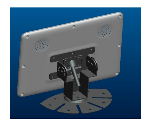
Suitable for curved console