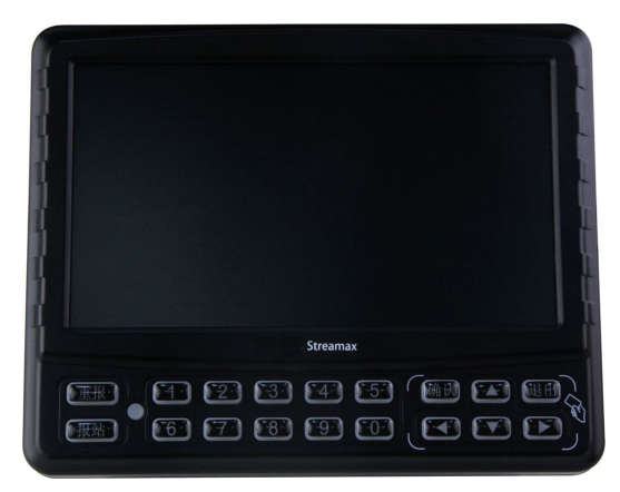
Front Panel of CP4